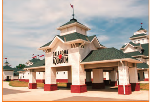
The Oklahoma Aquarium in Jenks is home to a variety of marine and aquatic animals, and houses a unique tackle collection