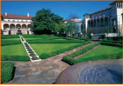
The Philbrook Museum of Art is a classical gem in the city, featuring permanent collections as well as traveling exhibits.