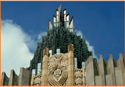
Boston Avenue United Methodist Church is one of the most significant examples of art deco architecture in the world, and is listed on the National Register of Historic Places.