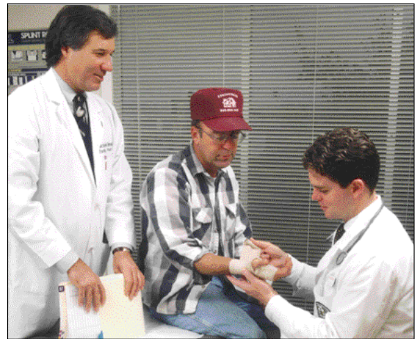
Medical Students receive guidance and mentoring from faculty doctors in rural areas throughout the state.